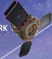
GÖKTÜRK EO SATELLITE